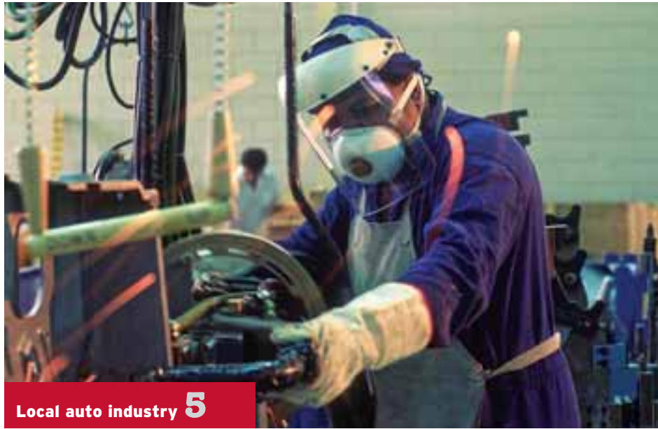
Local auto industry 5