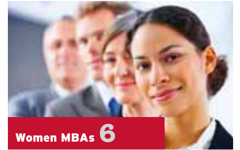
Women MBAs 6