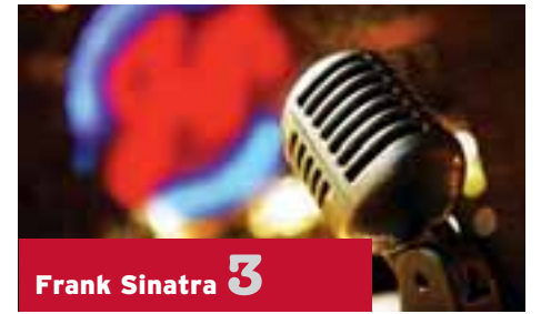
Frank Sinatra 3