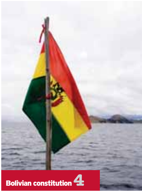
Bolivian constitution 4